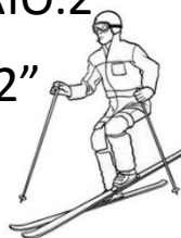
Tableau de reglage SKITRAB "TITAN VARIO.2"

Parameters according to the skiing ability